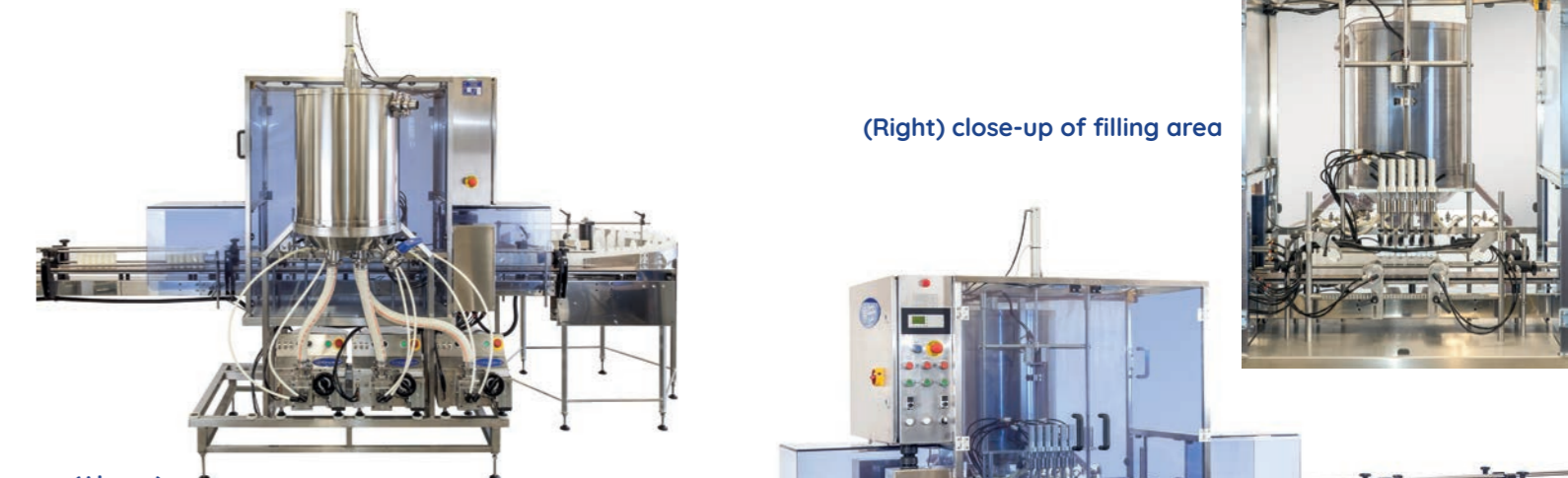
(Above) Automation System with three Response units fitted, seen from the rear